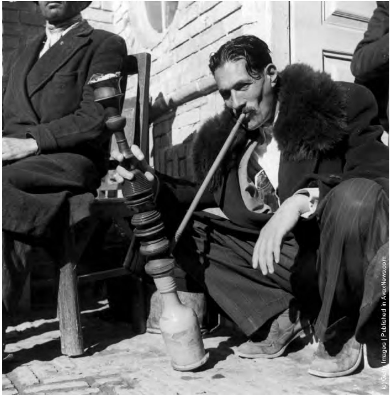
An Iranian smokes a water pipe on the pavement in Isafahan. The pipe is hired by a specialist merchant for single use. Circa 1955