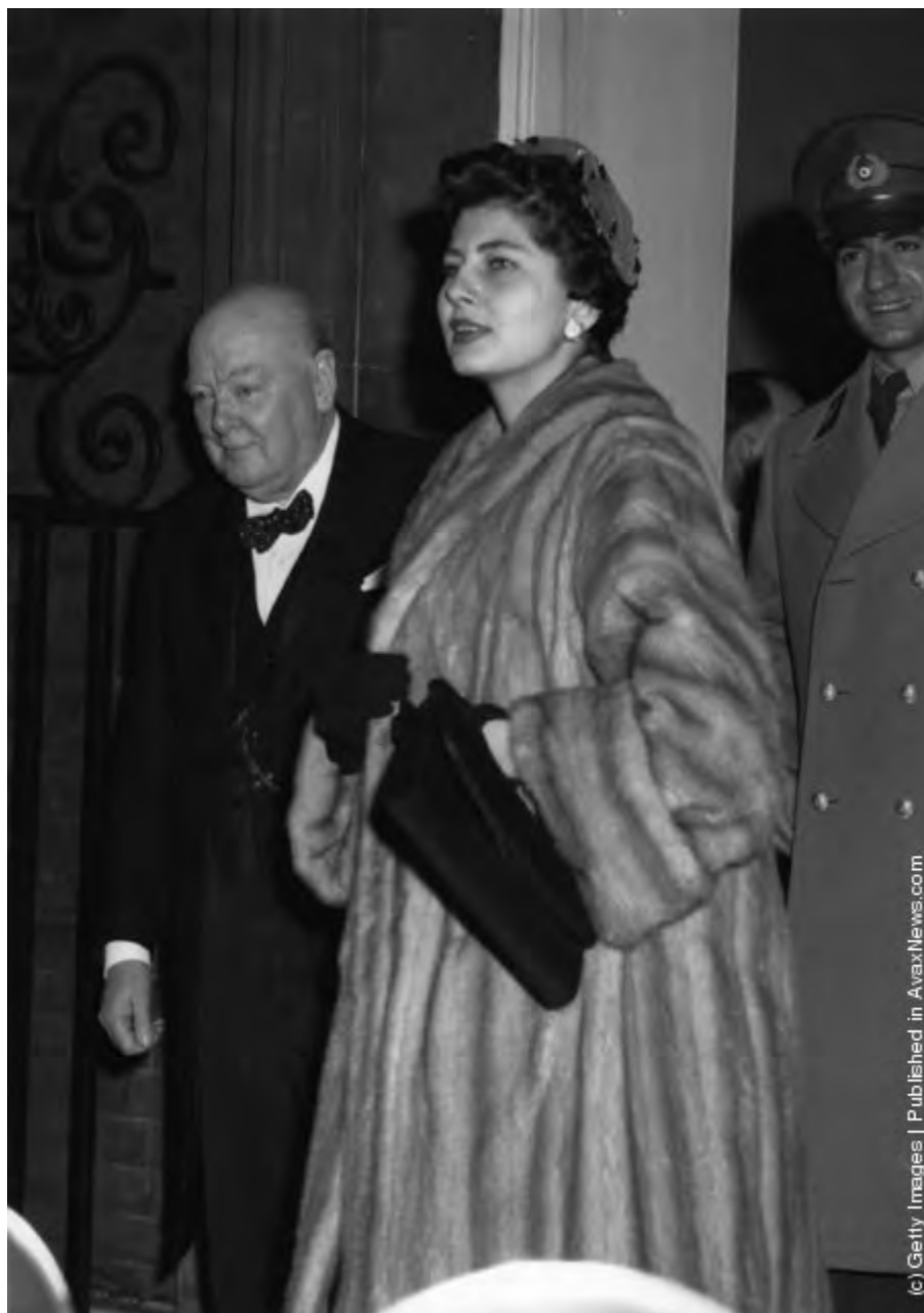
The Shah of Iran and his wife Queen Soraya Esfandiari Bakhtiari with Sir Winston Churchill leaving No 10 Downing Street. 1954