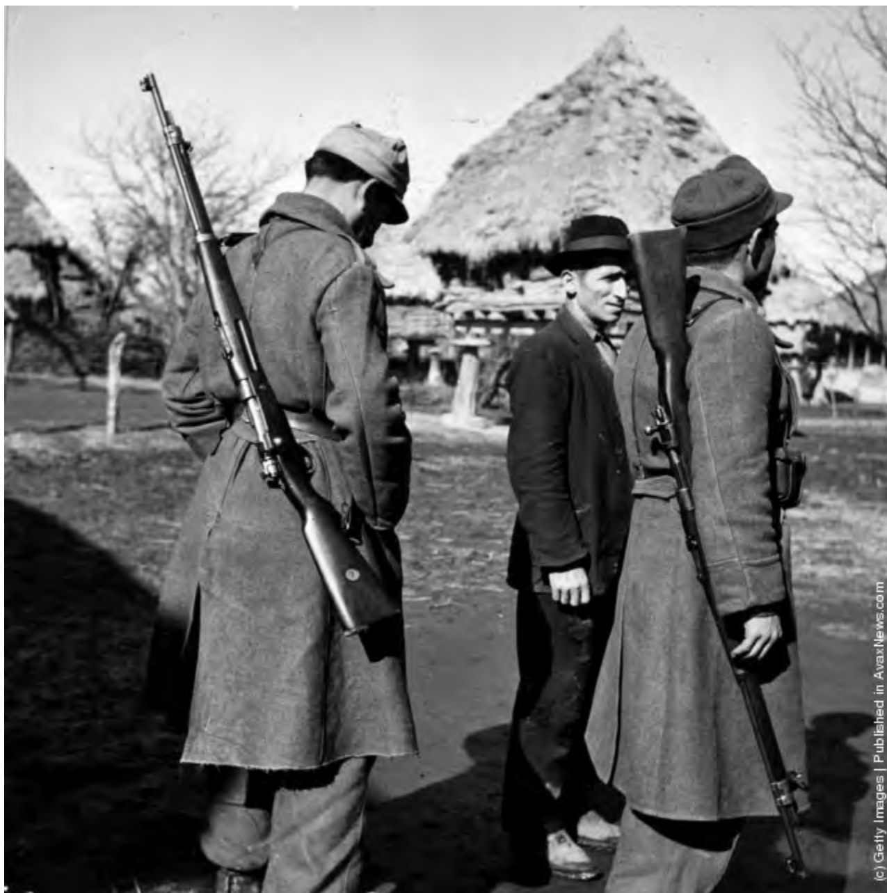
A deserter from the army being escorted by two members of the military police. Desertions from the Army is a crime,(Photo by Three Lions/Getty Images). Circa 1952