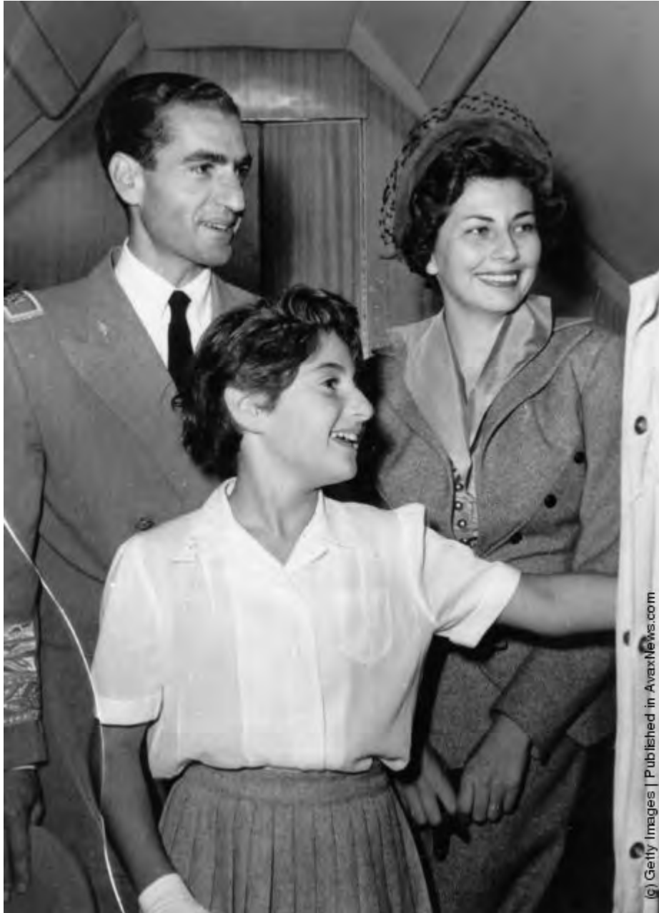
Mohammed Reza Pahlavi, Shah of Iran, with his wife Soraya, Queen of Iran and daughter Princess Shahnaz, from a previous marriage, at the airport at Tehran, bound for Switzerland. February 1953