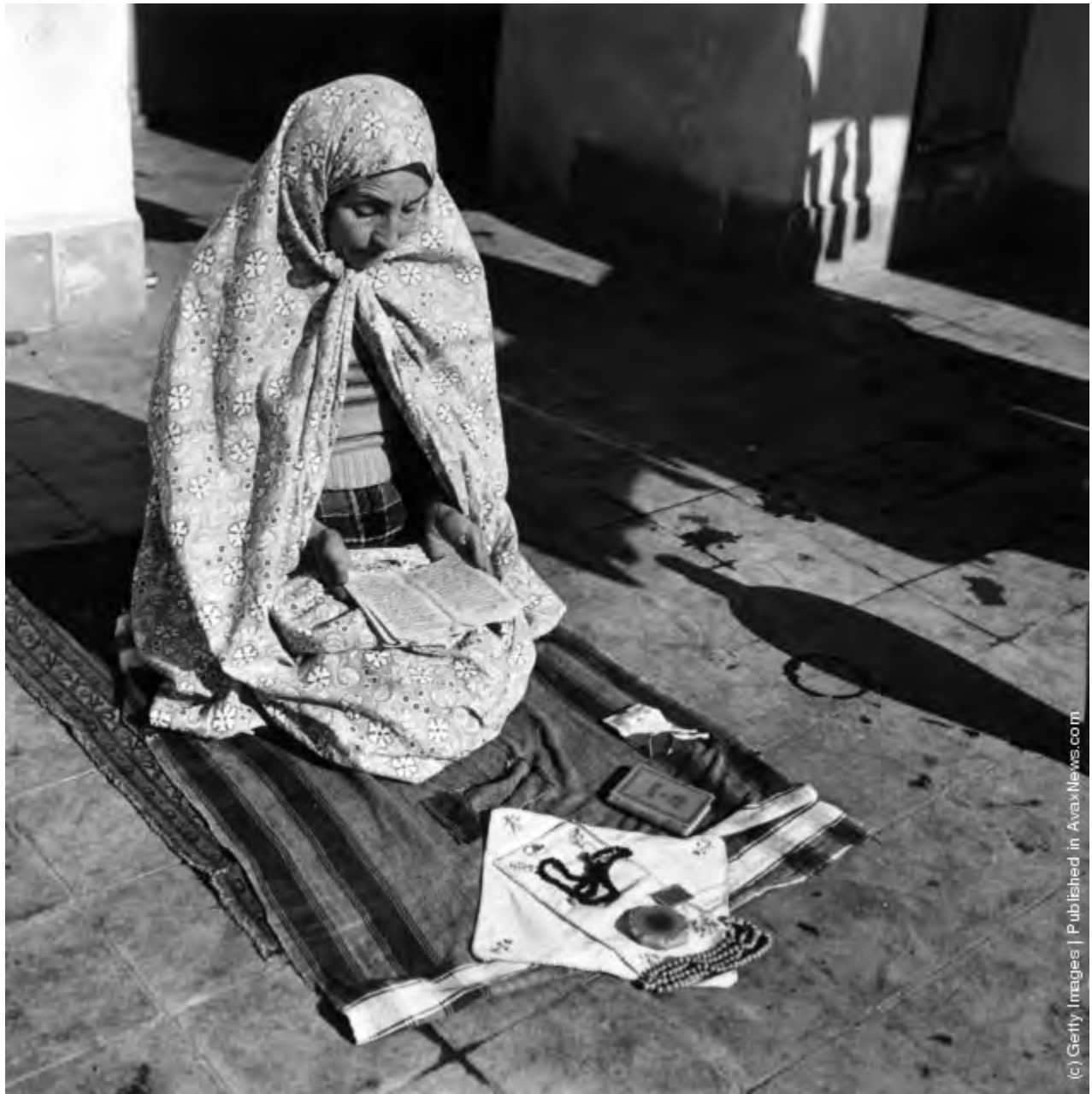
A woman reading from the Koran during her prayers which she makes five times a day. Circa 1955