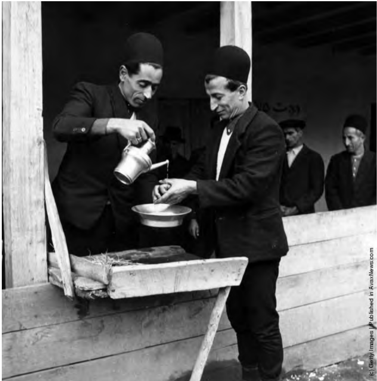
Two men perform the customary hand-washing ceremony at a traditional wedding in the Mazandaran province of Iran. Circa 1950