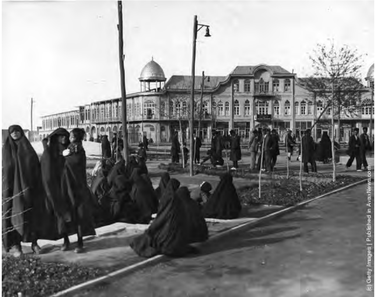
The central square of Hamadan. 1950