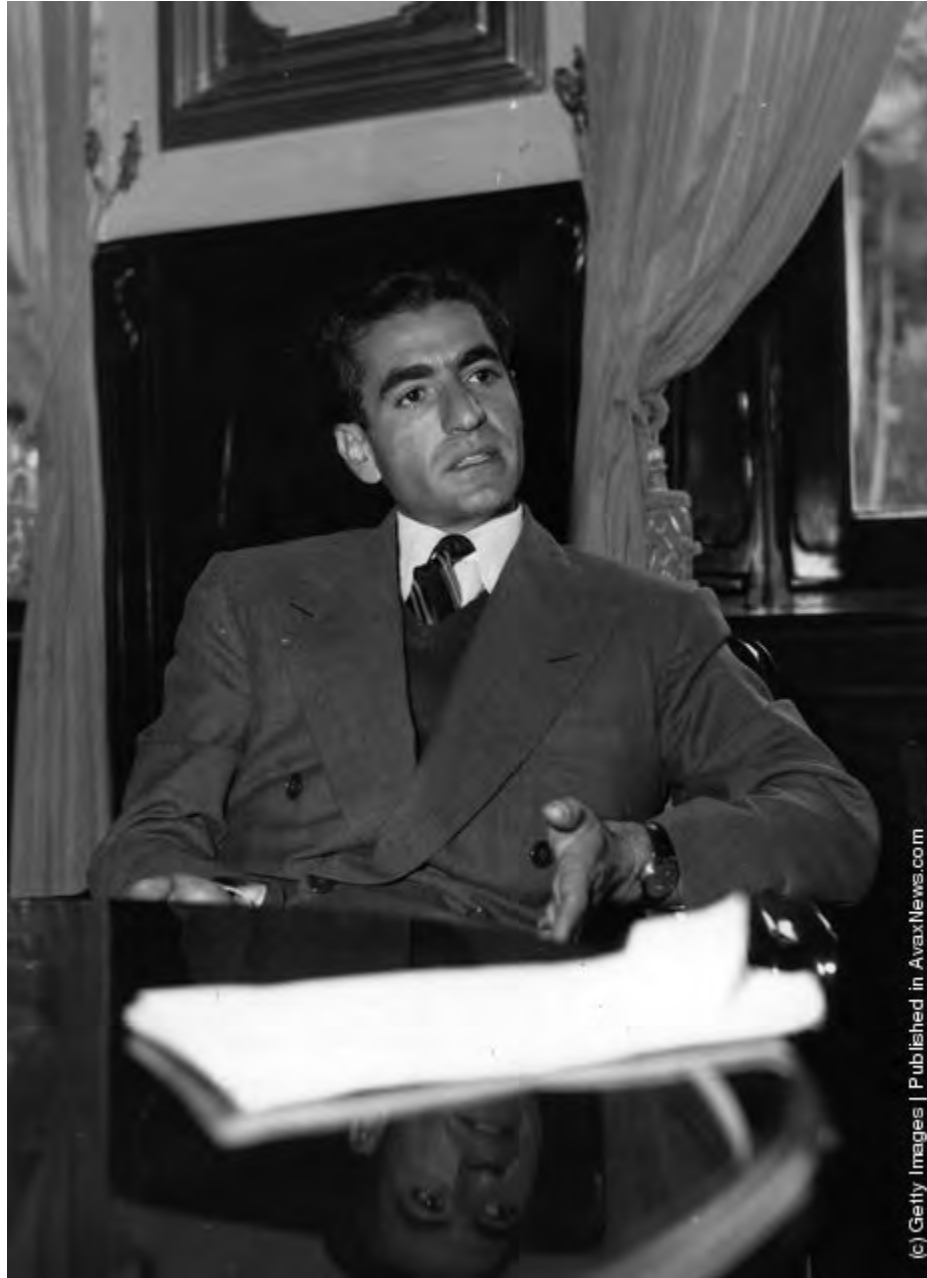
Mohammed Reza Pahlavi, (1919–1980), the Shah of Iran. Circa 1950