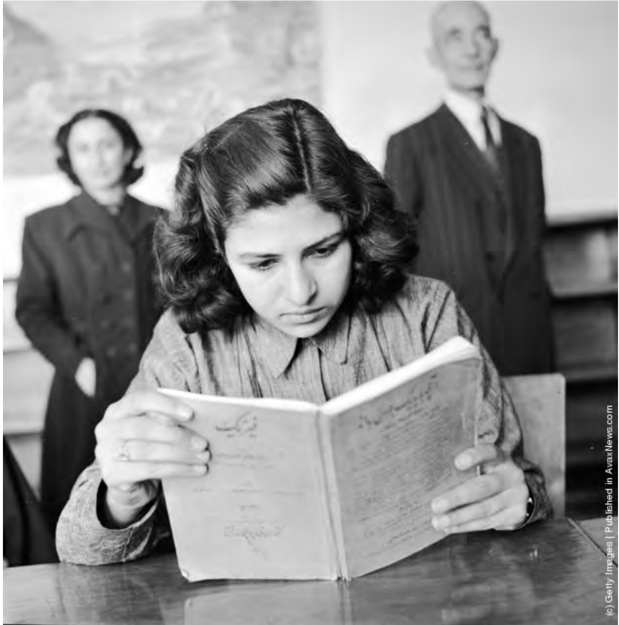
A girl student at a vocational training school for seamstresses studies the theoretical aspects of her work. This is one of the first schools for girls founded by the government in Teheran. Circa 1952