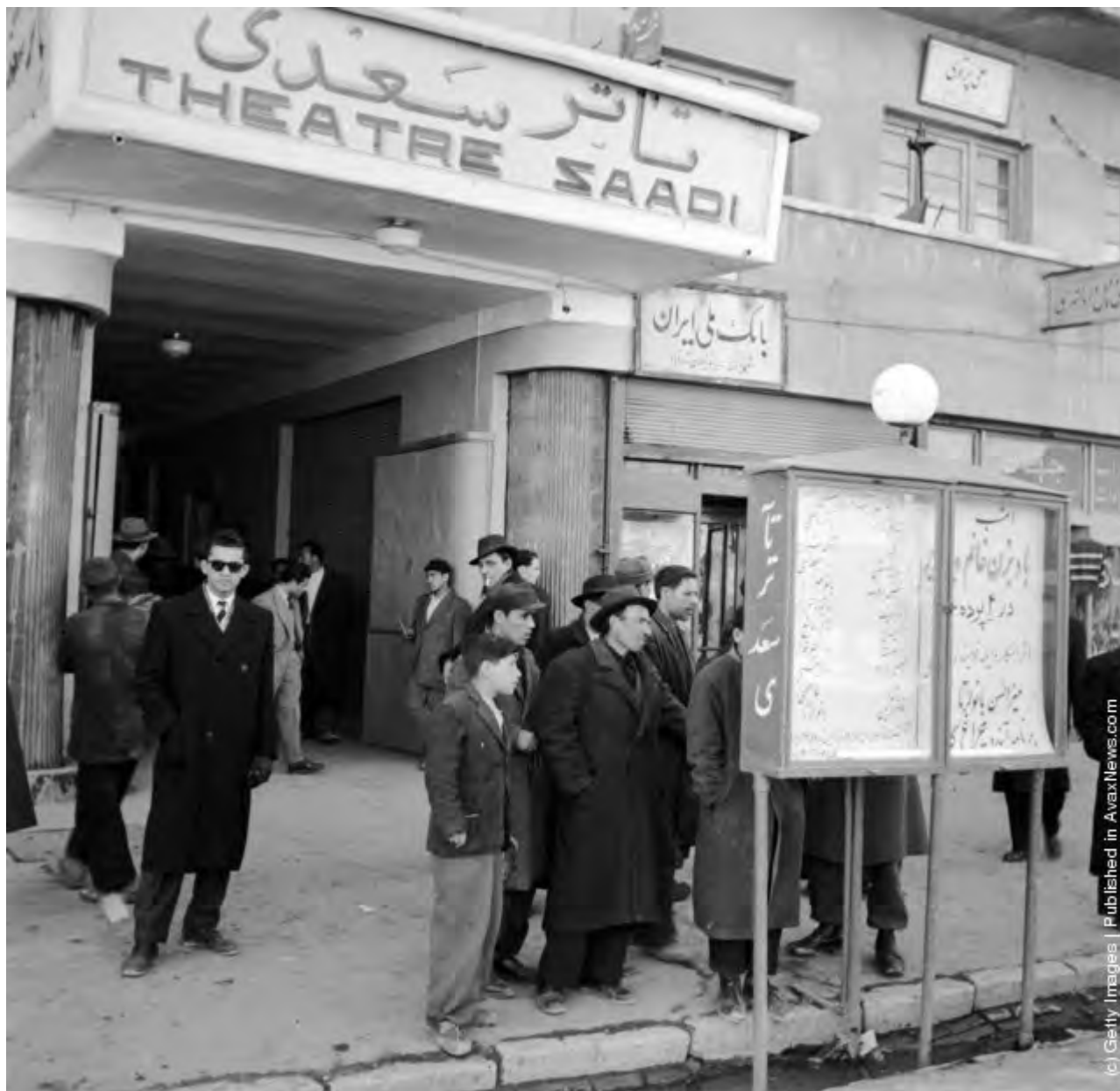
The exterior of Tehran's Theatre Saadi where a group of people study a billboard.

(Photo by Three Lions/Getty Images). Circa 1950