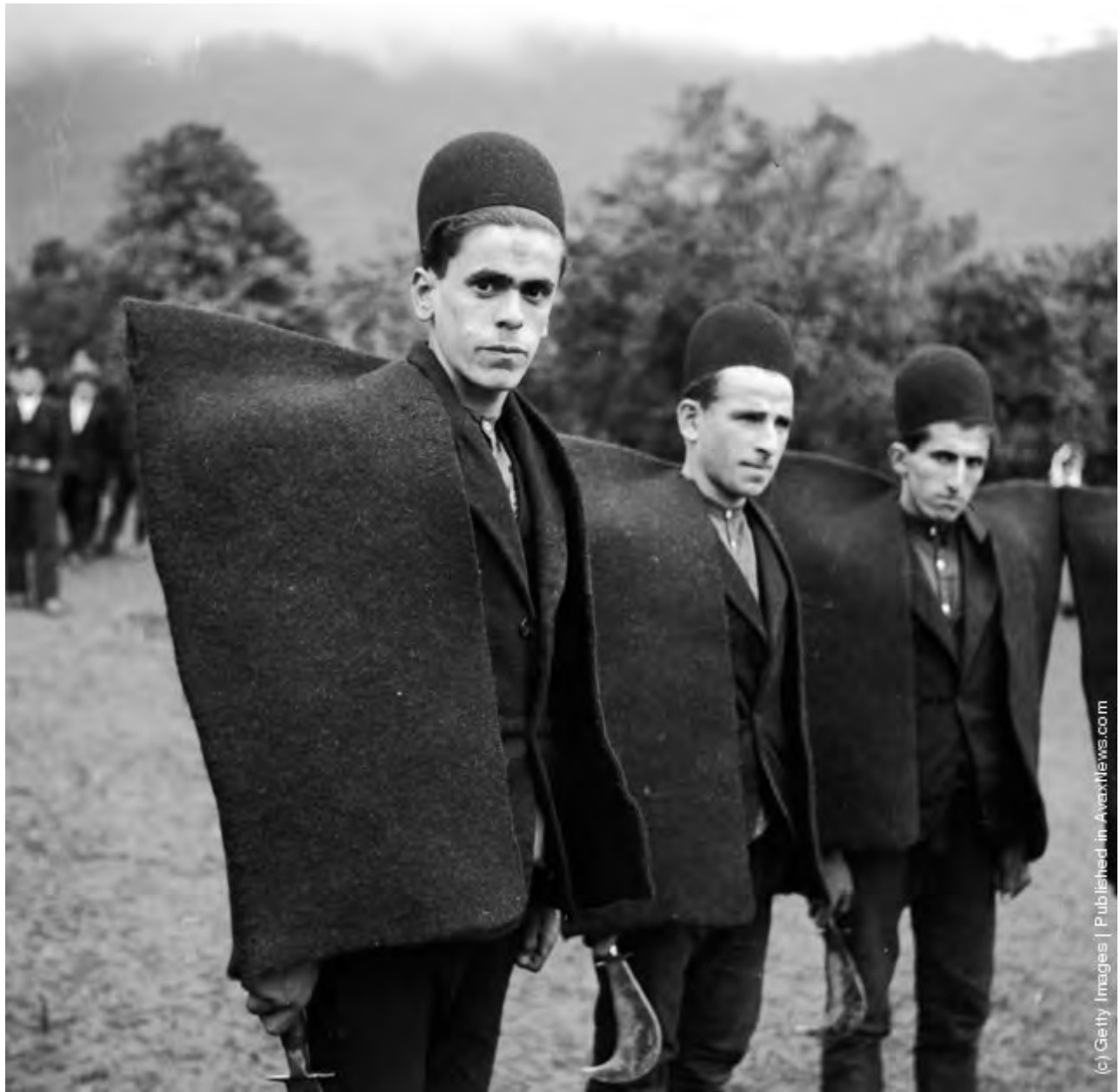
Shepherds from the north wear their traditional heavy woolen mantles as they stand ready to shear sheep with scythe-like shears. Circa 1952