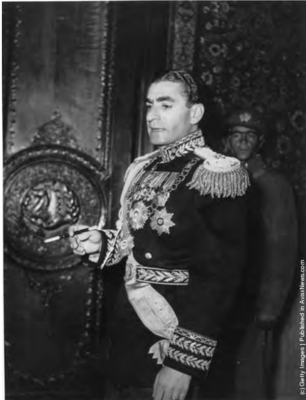
Muhammad Reza Shah Pahlavi, the Shah of Iran, immediately before his wedding.

14th February 1951