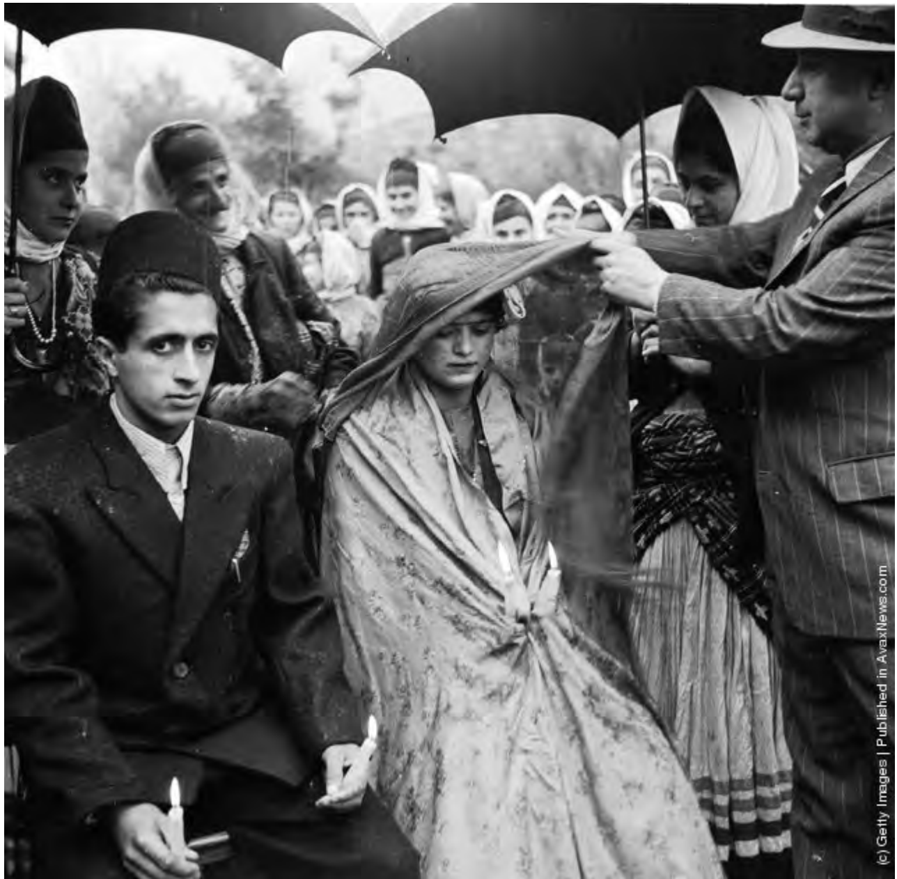
A Khan or feudal lord of a province lifts the veil from the face of a bride in a village wedding ceremony. Her groom sits beside her with lit candles symbolizing life.

Circa 1952