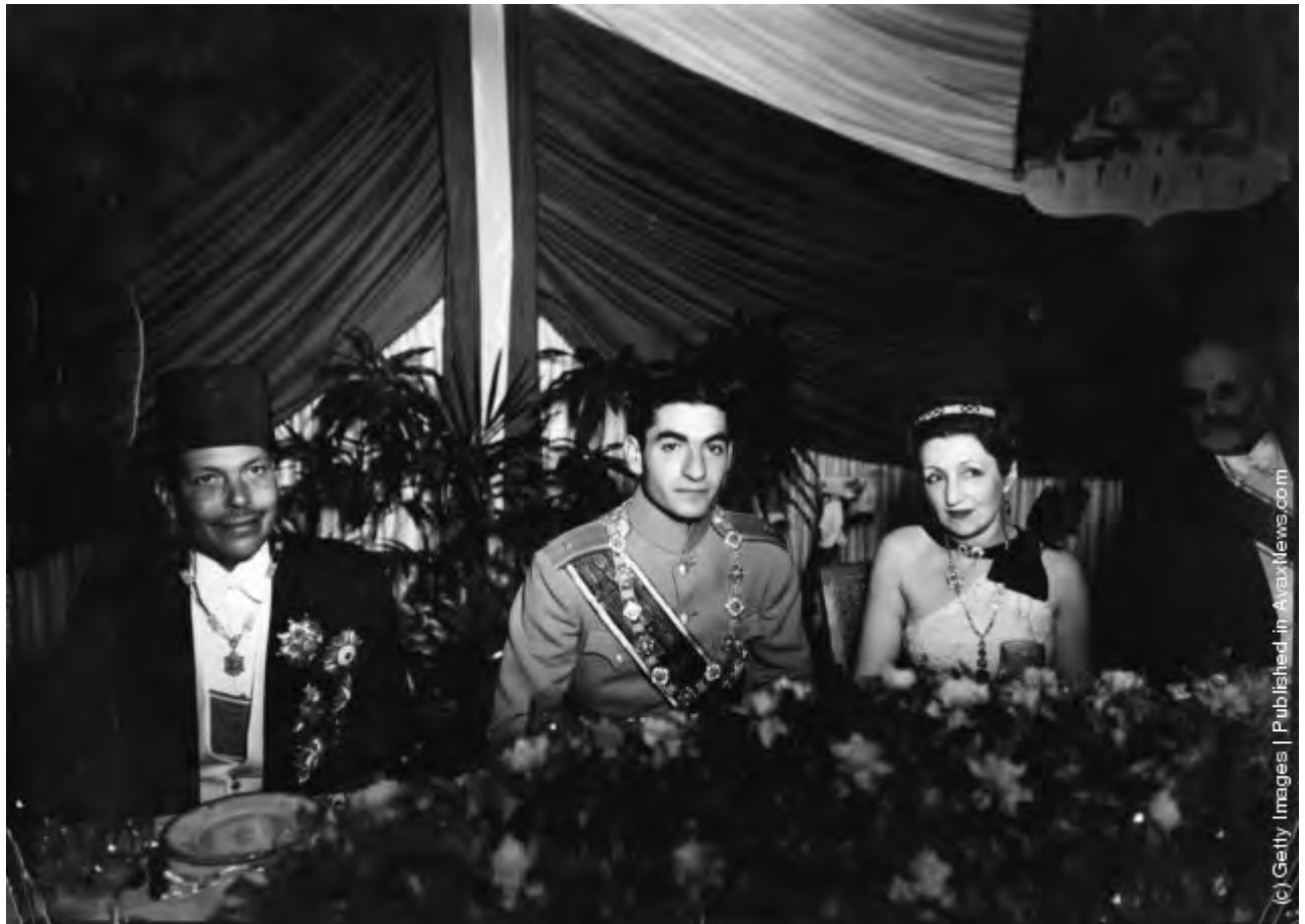
The Shah of Iran Mohamed Mahoud Pasha and the Prince of Iran at table.

(Photo by Riad Shehata/Getty Images). 1950