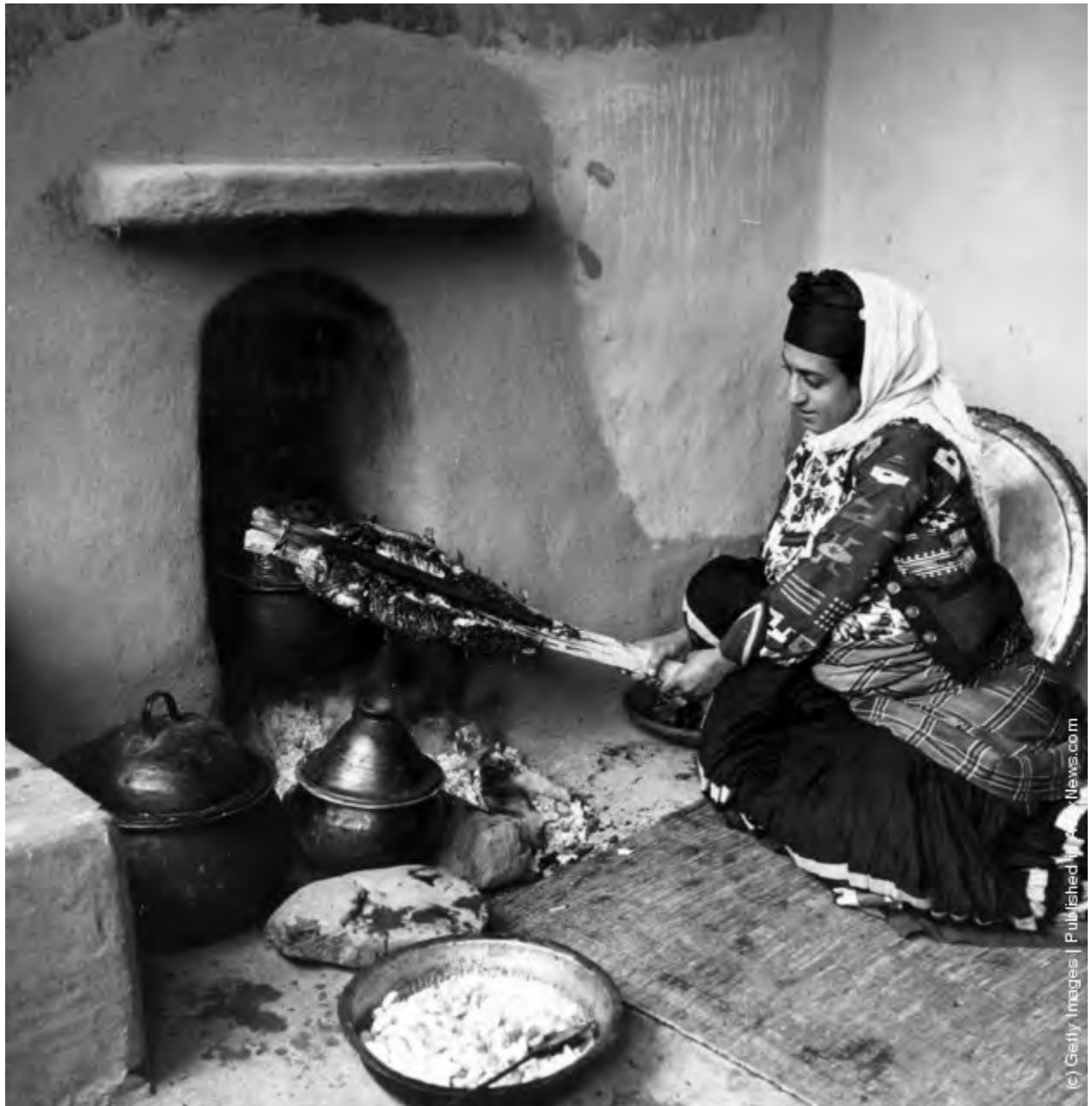
A woman roasts a joint of meat, in the Mazandaran province of northern Iran.

Circa 1950