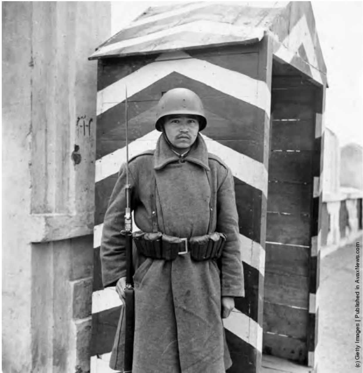
An Iranian soldier on sentry duty at his post near the Russian border at Babol-Sar, Iran. Circa 1955