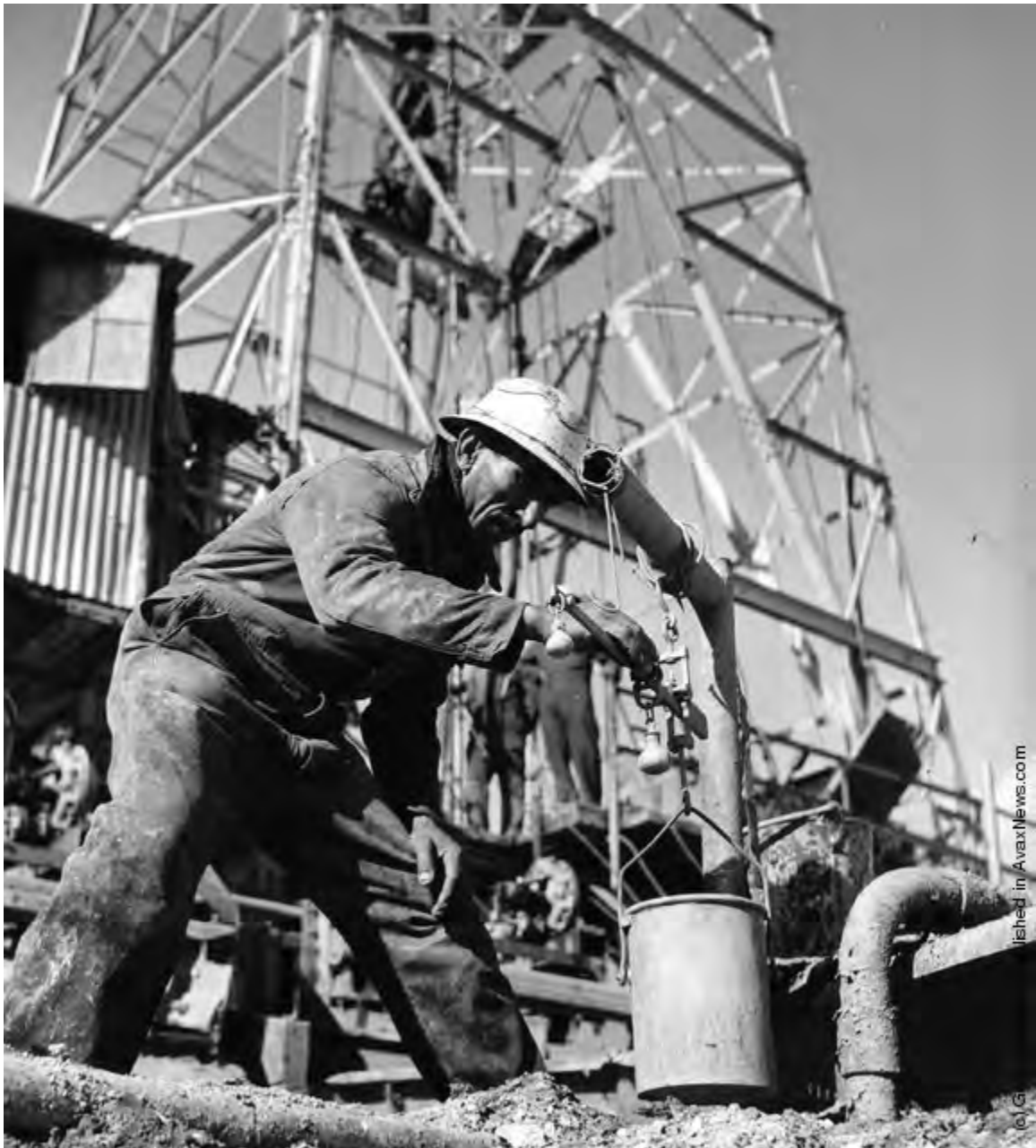
Oil drilling taking place in Iran. Circa 1955