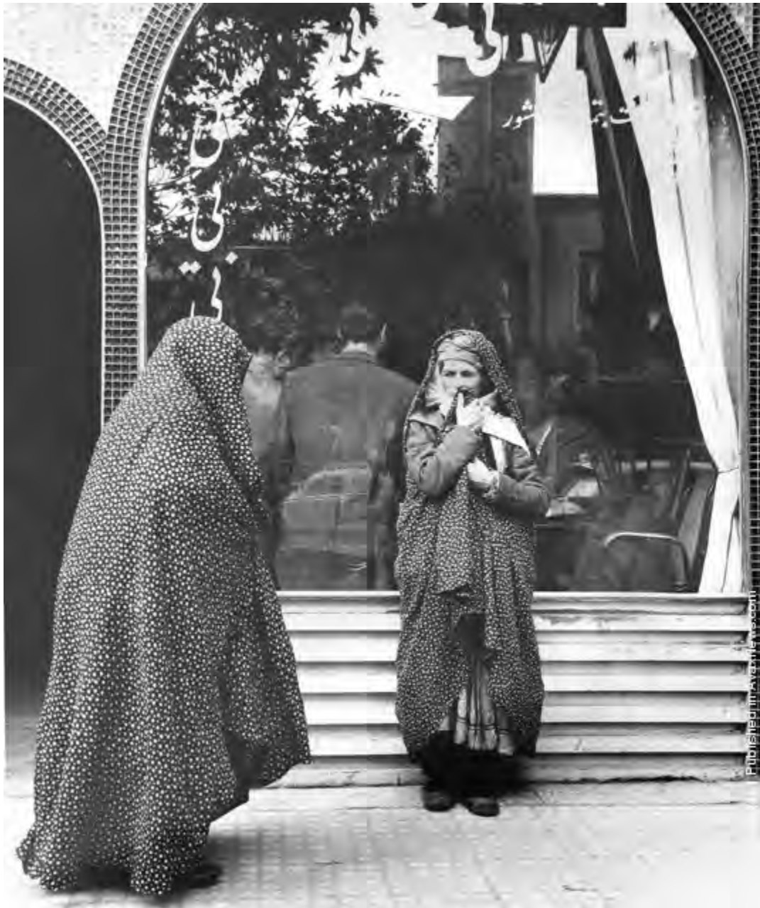
Iranian women wait outside whilst the men are discussing travel Ticket from a famous Bus Service (TBT) in Mashad, Iran.