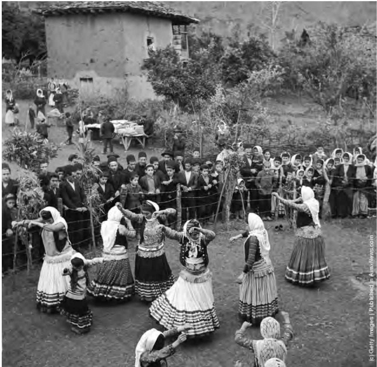
Village girls dance at a wedding festival in the Mazandaran province of northern Iran, near the Caspian Sea. Circa 1952