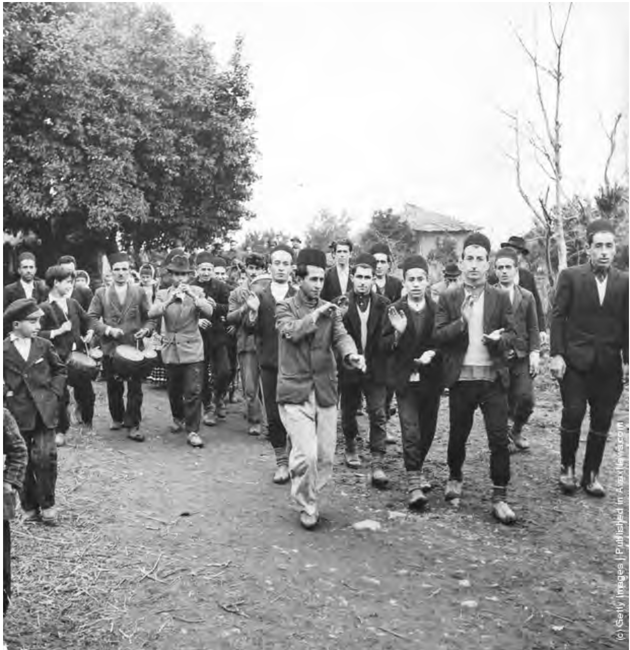
Musicians herald the coming of bridal guests during a wedding ceremony in the Mananderen province near the Caspian Sea. Circa 1955