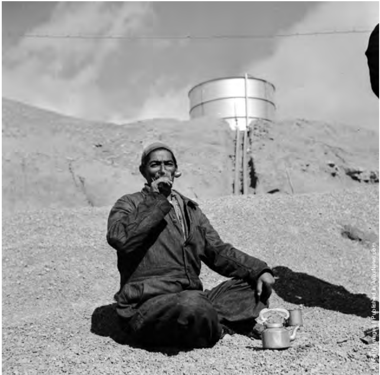
An Iranian oil worker in an arid landscape, an oil tank in the distance, sits enjoying lunch and tea. Circa 1954