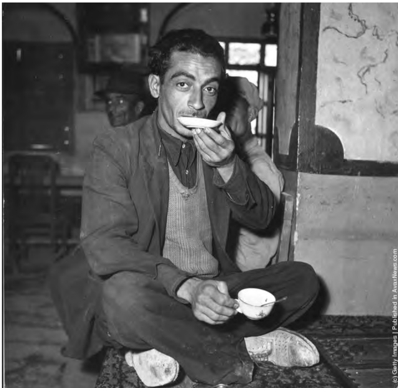
An Iranian man finishing his cup of tea from the saucer. Circa 1955