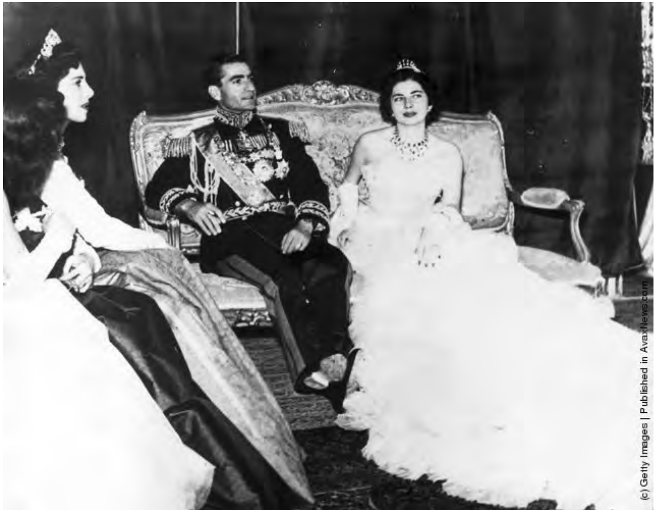
Muhammad Reza Pahlavi, the Shah of Iran with his second wife Princess Soraya Esfandiary Bakhtiari after their wedding ceremony. His sisters who acted as bridesmaids are on the left. The marriage was dissolved in 1958.

February 1951