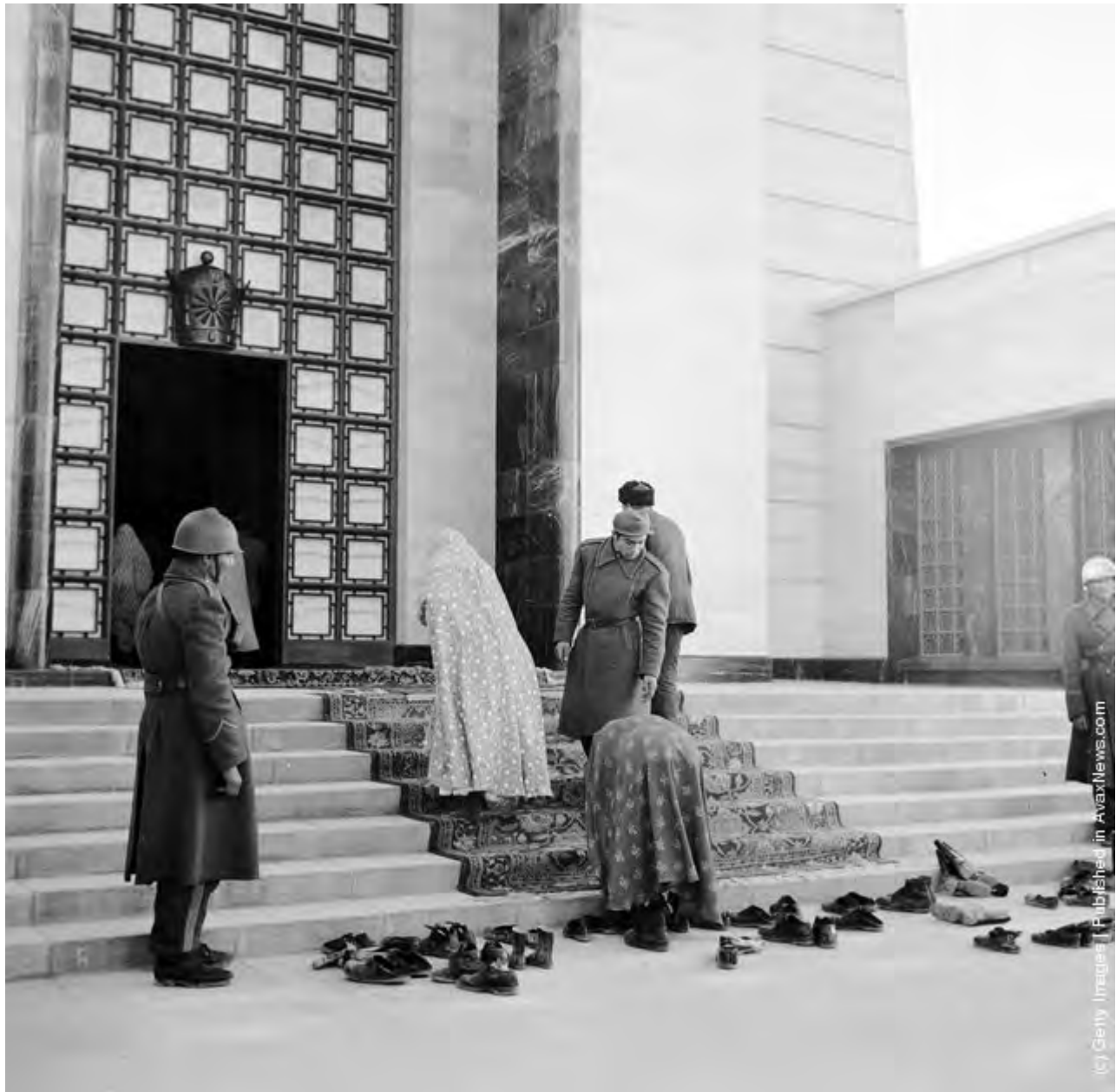
Women taking off shoes at the entrance to Mausoleum of Reza Shah The Great, Builder of Modern Iran. Circa 1950