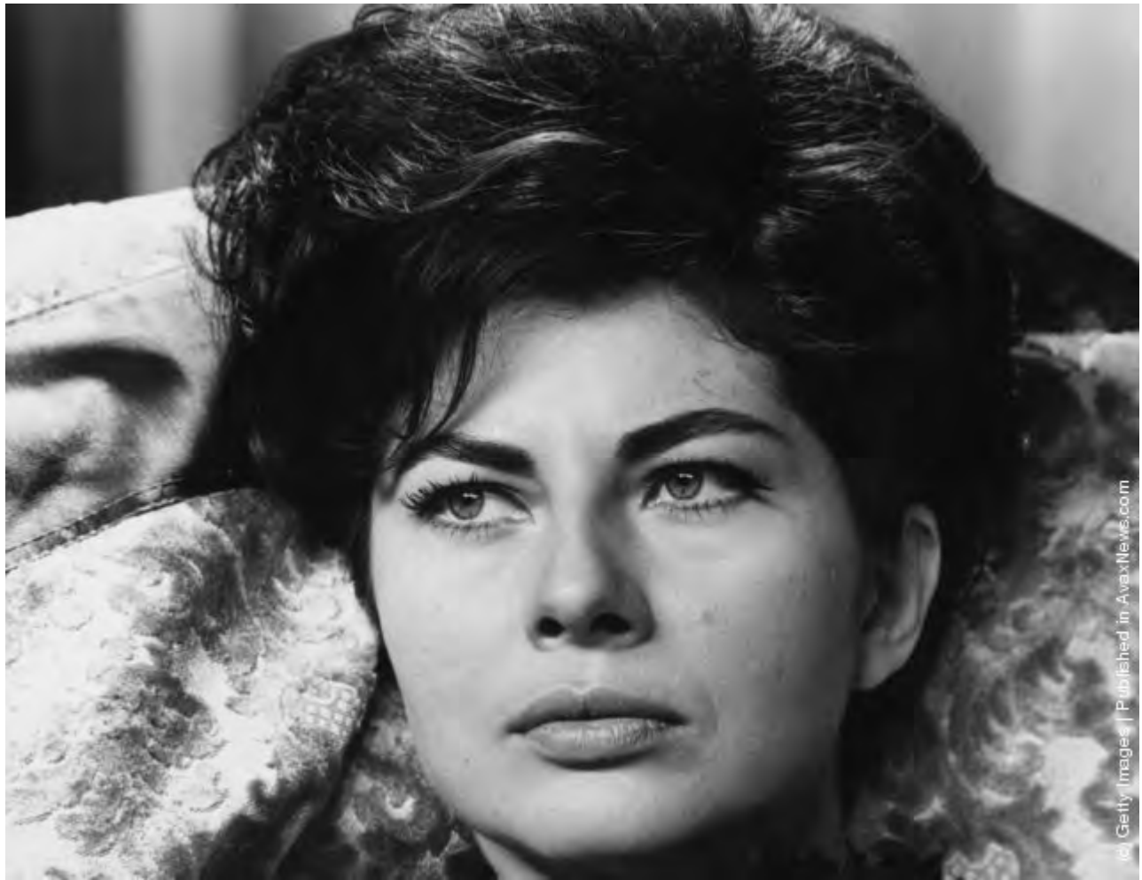
Princess Soraya Esfandiary Bakhtiari (1932–2001), the Empress of Iran and wife of Muhammad Reza Shah Pahlavi. The marriage was dissolved in 1958. Circa 1950