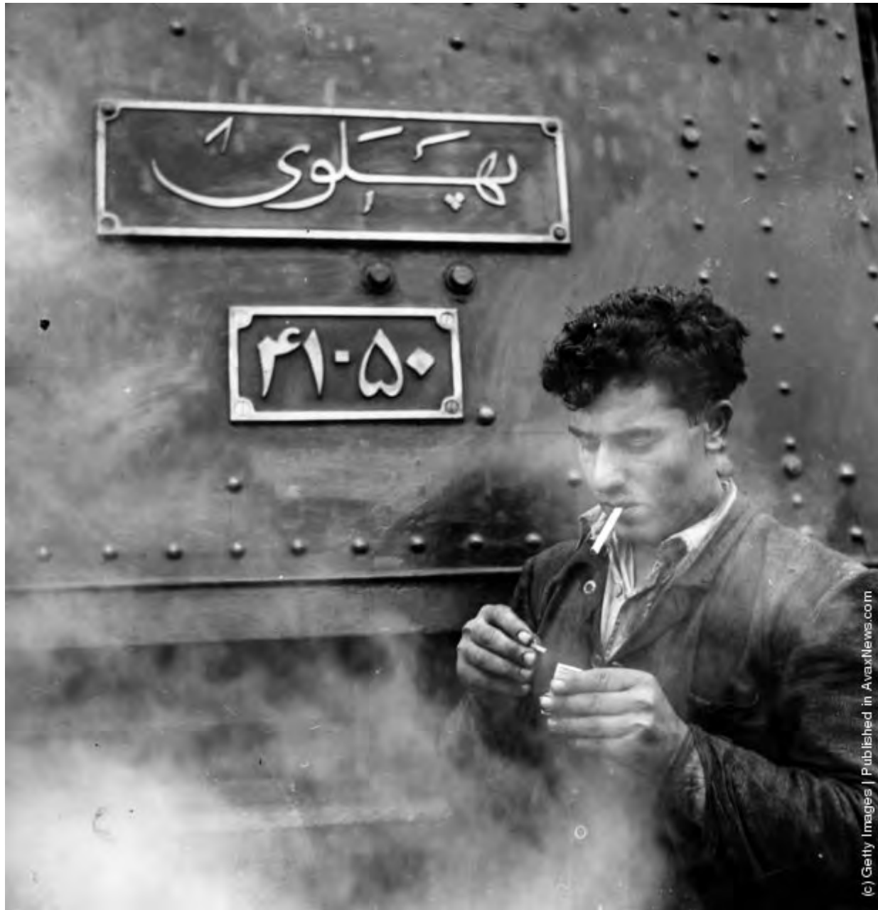
A railway engineer resting for a cigarette at Zagheh in the Luristan mountains of West Central Iran. Circa 1955