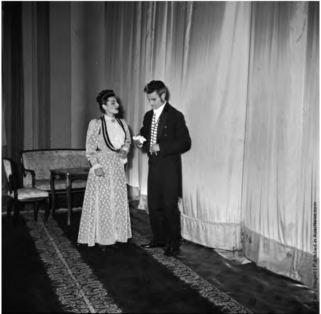
Two actors from a production of Oscar Wilde's play, "Lady Windemere's Fan" talk back-stage at the Theatre Saadi in Tehran. Circa 1950