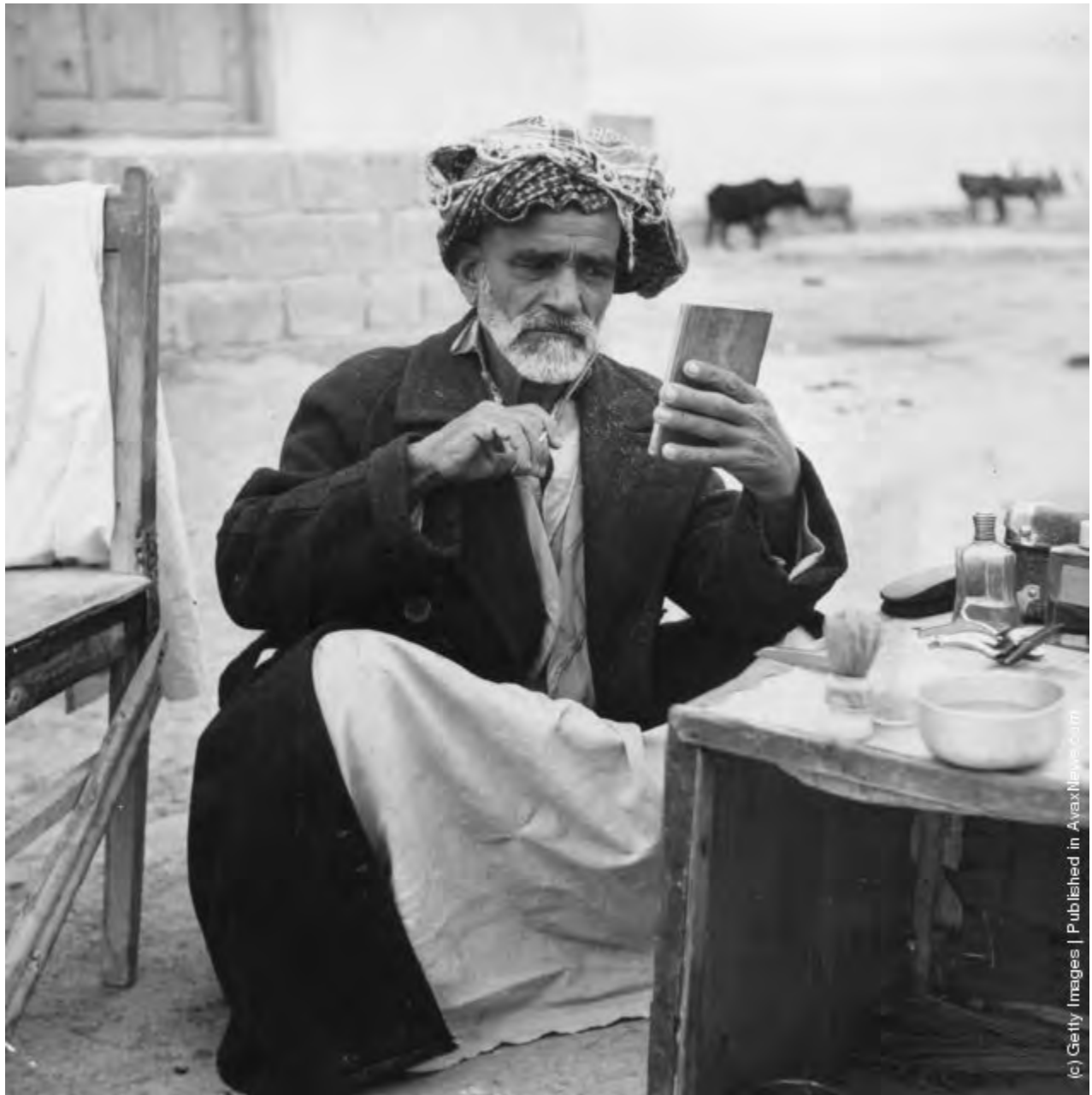
A man trims his beard at a self-service barber shop at Aga Uhari, Iran.

Circa 1955