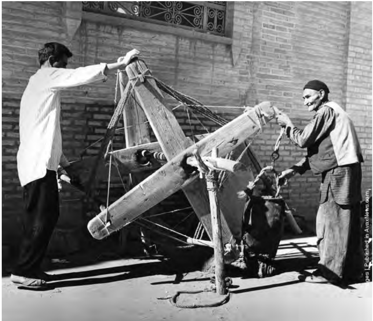
A well is dug in Yazd, Iran, using a wooden windlass and leather bag. Many of the methods and construction techniques used in Iran have historic technic, way before European knew it.