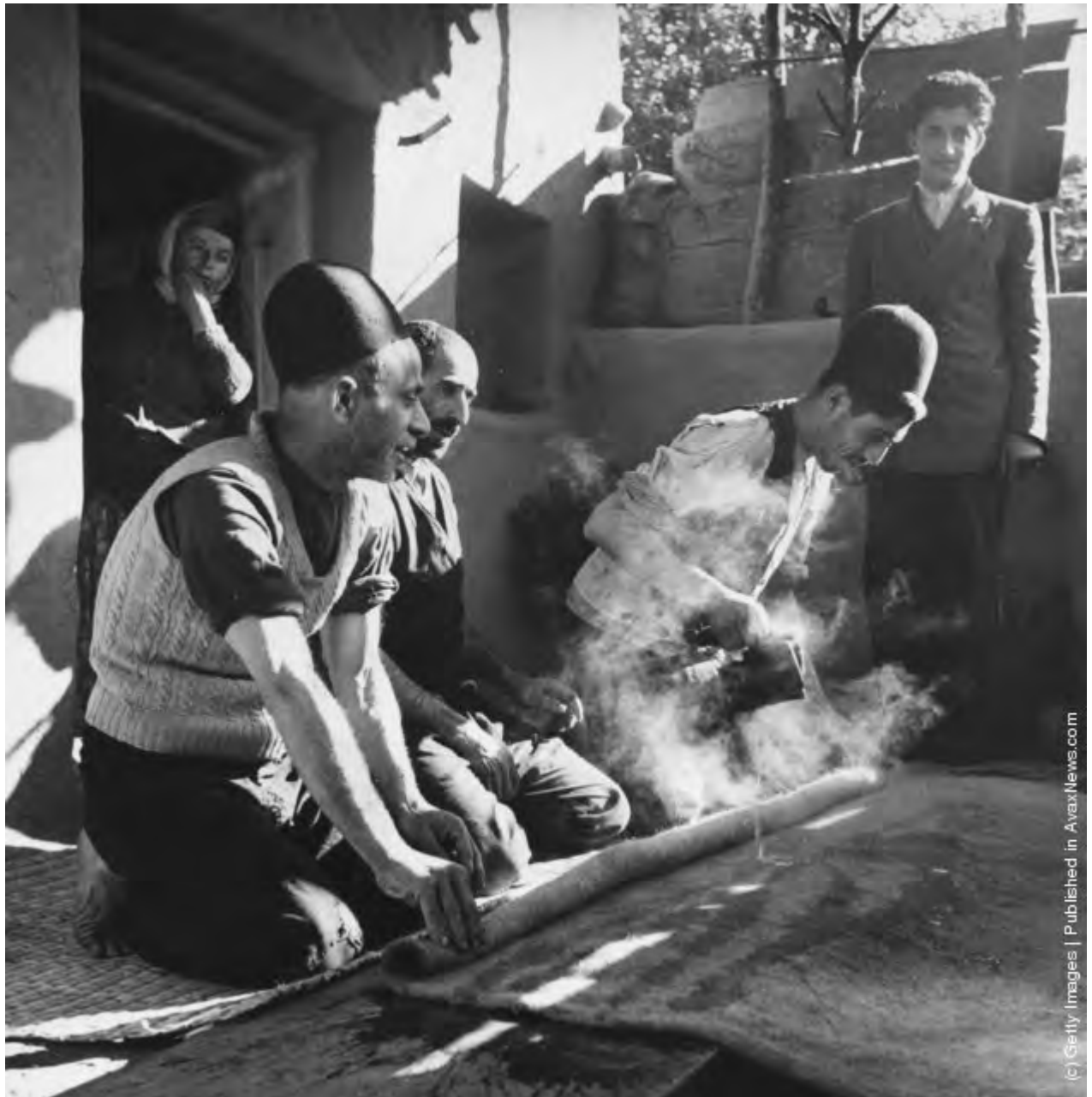
Making rugs by kneading pieces of wool together after steaming them under pressure. Circa 1950