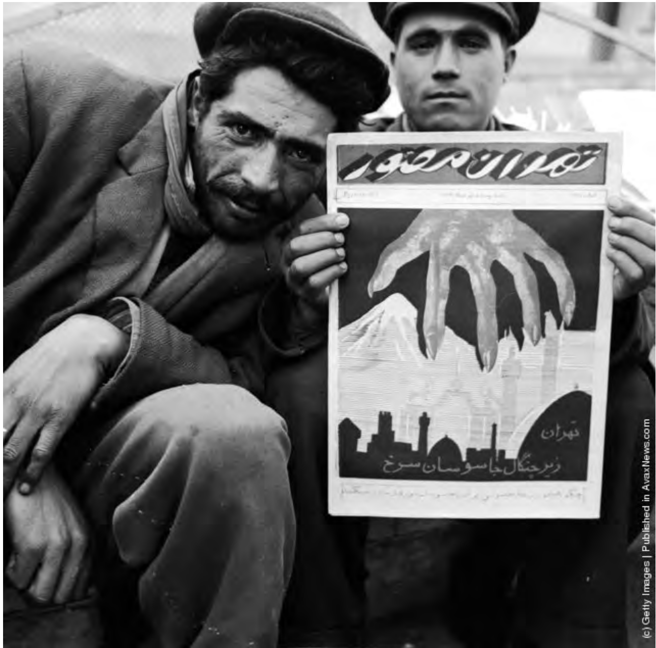
Iranian newspaper (Tehran Mossavar) lead with a cover denouncing the encroachment of Russia's influence in Iran. In this newspaper a red-starred hand is shown reaching over the northern border mountains of Iran into the Majles, Parliament of the nation. 1952