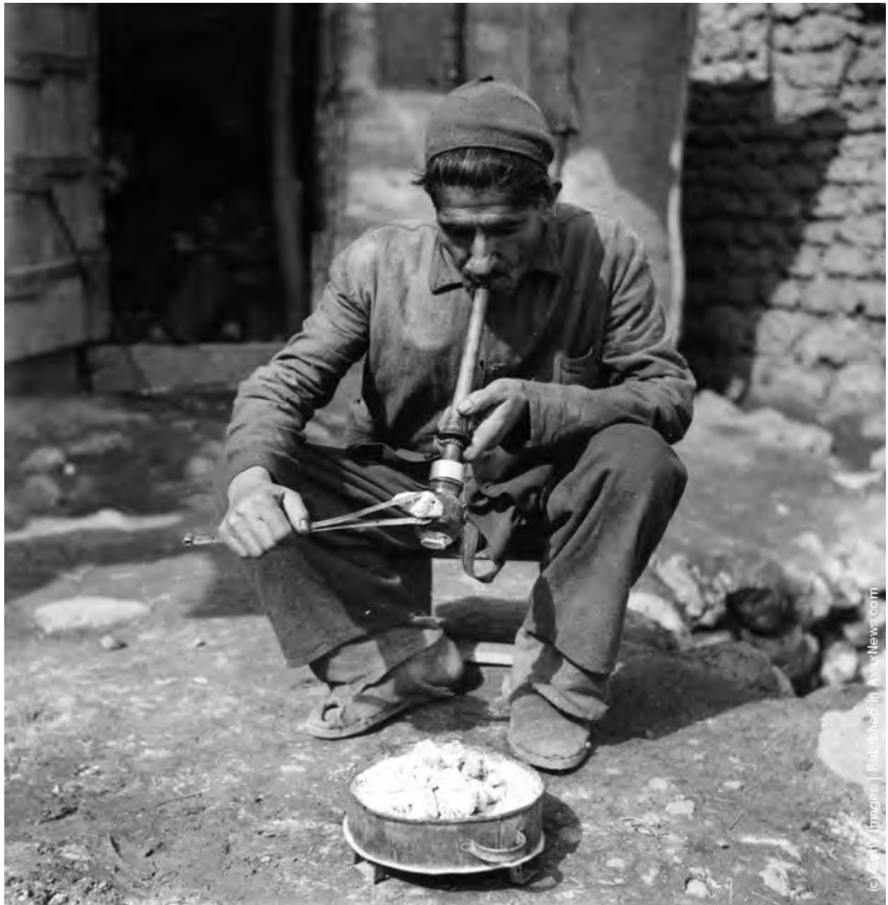
A man smoking opium in a village in Iran. Circa 1955