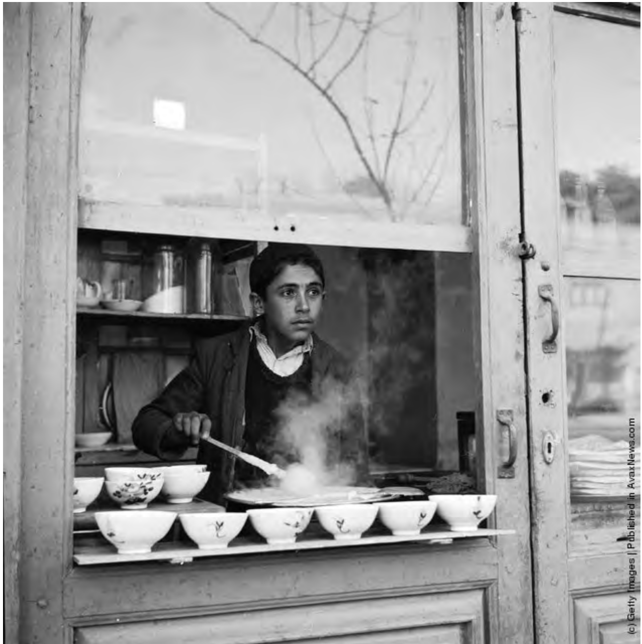
A street stall in Teheran selling bowls of steaming soup. (Photo by Three Lions/Getty Images). Circa 1952