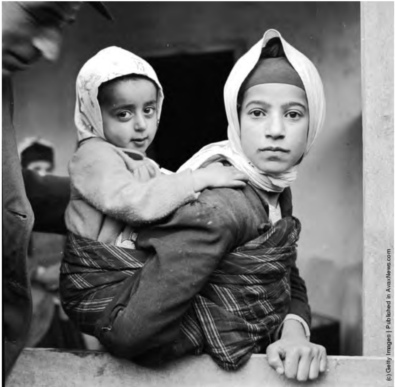
A young mother and child from the Mazandaran province in northern Iran near the Caspian Sea and the Russian border. Circa 1952