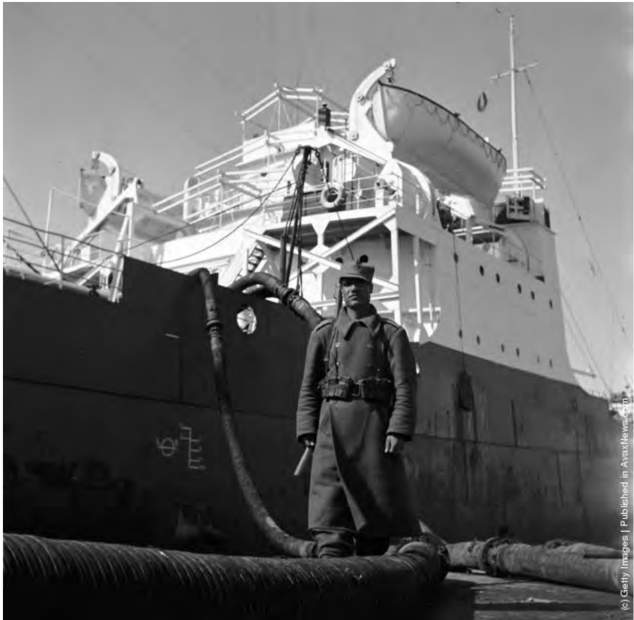
An Iranian soldier guarding an oil production site belonging to the Iranian oil company at Abadan on the northern tip of the Persian Gulf.

Circa 1955